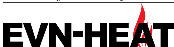
Figure 5. EVN-Heat Logo