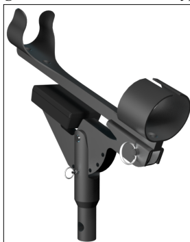
Figure 6. Got1Holder Prototype